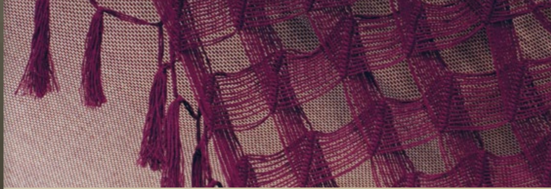
FAMILY HAMMOCK BOSSANOVA bordeaux BSH18-7